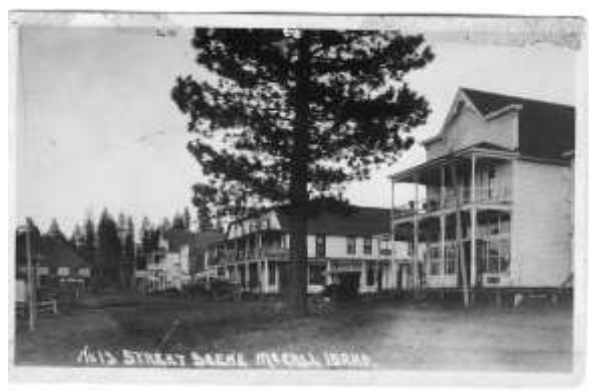
MLC1.011 Hotel Lakeview c 1920s postcard

This plan is intended to guide the commission and the city in protecting McCall's historic and architectural character. The plan presents a vision and mission, a list and mapping of the city's historic buildings, potential property nominations to the National Register of Historic Places, and preservation strategies and recommendations.