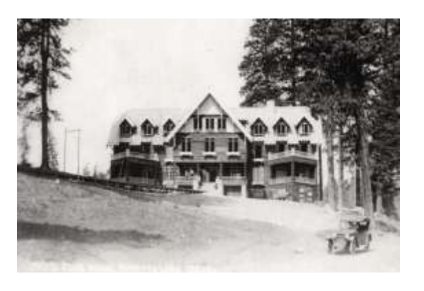
The Payette Lakes Inn in its early years featured numerous gables and white-railed balconies. The chalet-style inn was a popular gambling and relaxation spot for movie people during the filming of Northwest Passage in 1939.

The inn is significant to the history of recreation in Payette Lake, McCall, and Central Idaho. The two-acre property is currently for sale and the vacant inn is in very poor condition. If the inn were placed on the National Register of Historic Places, the owner would potentially be eligible for tax investment credits.