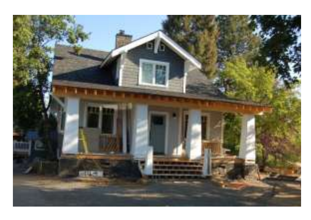
The Carl Brown House is undergoing rehabilitation to bring back its original character.

A similar workshop would encourage owners of city center buildings to rehabilitate their historic store fronts. Through education and encouraging a professional ethic for handling historic properties, the commission would lead the effort to protect and preserve the city's historic resources.