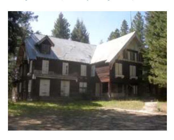
The Payette Lakes Inn, located on two acres off Warren Wagon Road, is now in poor condition and for sale. If the inn were placed on the National Register of Historic Places, a new owner rehabilitating the historic building would potentially be eligible for a 20 percent tax investment credit.