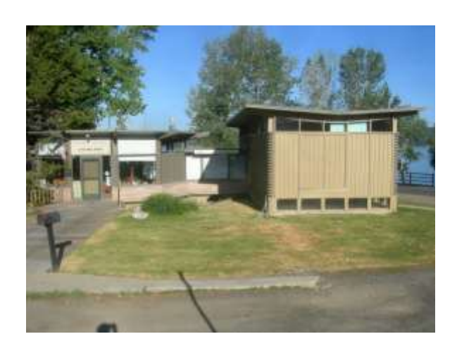
An example of mid-century architecture representing contemporary design.