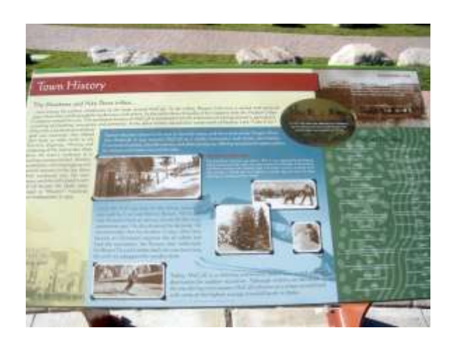
One of a number of downtown interpretive signs featuring McCall history.

In 2005, the McCall Historic Preservation Commission oversaw a McCall Windshield Survey of historic buildings, and in 2007 assisted in updating the master plan document for the Central Idaho Historical Museum. To celebrate 100 years, the commission hosted the City of McCall's centennial on July 19, 2011, and produced an Historic Downtown Walking Tour brochure of McCall. Recent efforts recognize the city's history with interpretive panels located along the lakefront.