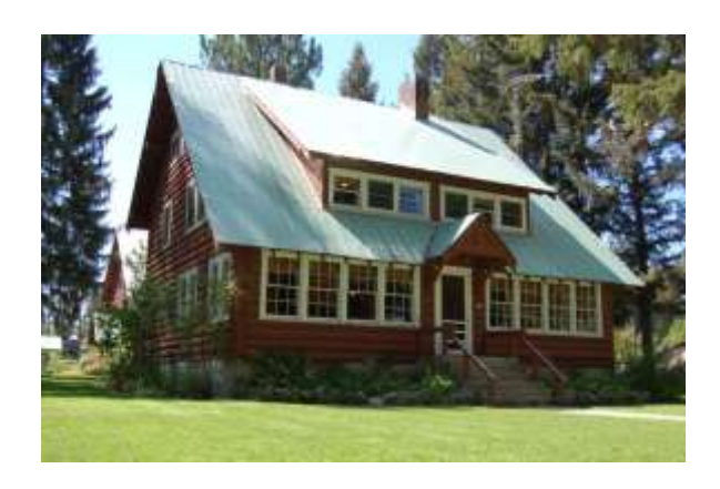
Handsome log SITPA Fire Warden's House built in 1937 by the Civilian Conservation Corps.

McCall offers an excellent visitor experience featuring the rustic 1937 Civilian Conservation Corps (CCC) buildings and a Corliss lumber mill engine within the Central Idaho Historical Museum. This grouping of log and frame buildings within the city center provides an excellent public introduction to the city's history and architecture. The museum site, known as the Southern Idaho Timber Protective Association (SITPA) Buildings, is