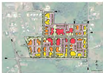
Business Park Concept