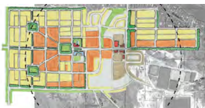
West Valley Concept Plan