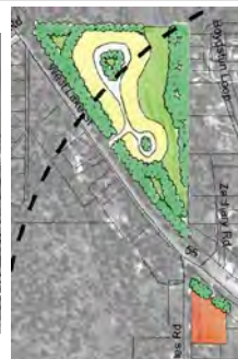
West Lardo Concept