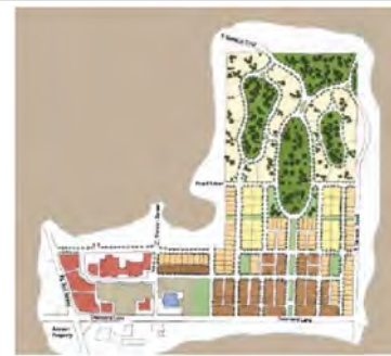
State 80 Concept