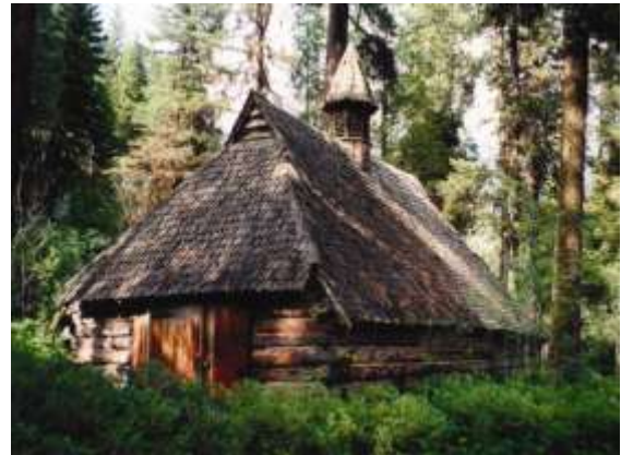
The Sylvan Beach Ice House built ca. 1932 supplied ice to the resorts cabins until 1943. Notice the shake roof and tall octagonal cupola.