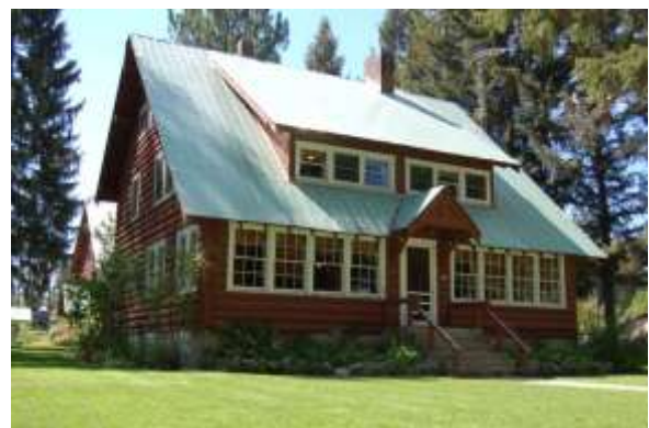
Handsome log SITPA Fire Warden's House built in 1937 by the Civilian Conservation Corps.

McCall offers an excellent visitor experience featuring the rustic 1937 Civilian Conservation Corps (CCC) buildings and a Corliss lumber mill engine within the Central Idaho Historical Museum. This grouping of log and frame buildings within the city center provides an excellent public introduction to the city's history and architecture. The museum site, known as the Southern Idaho Timber Protective Association (SITPA) Buildings, is listed on the National Register of Historic Places. Likewise, the adjacent U.S. Forest Service (USFS) McCall District Administrative Site is listed on the register.