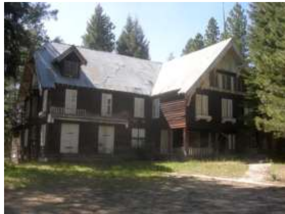
The Payette Lakes Inn, located on two acres off Warren Wagon Road, is now in poor condition and for sale. If the inn were placed on the National Register of Historic Places, a new owner rehabilitating the historic building would potentially be eligible for a 20 percent tax investment credit.