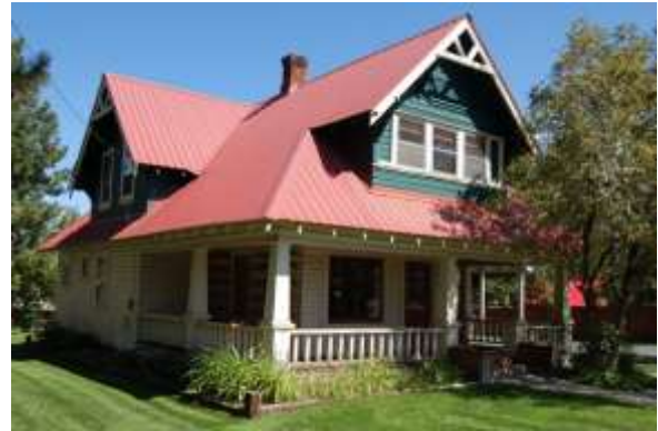
The Newt Williams House, built in 1910, is an excellent example of Craftsman-style architecture.

The Newt Williams house was built in 1910. Located at 133 Lake Street, the Craftsman-style house features a wrap-around front porch with large, square, battered porch posts. The gable roof has modified kings post trusses, dormer windows, and exposed eaves.