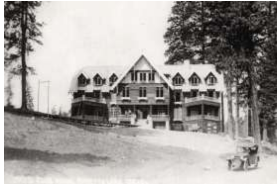
The Payette Lakes Inn in its early years featured numerous gables and white-railed balconies. The chalet-style inn was a popular gambling and relaxation spot for movie people during the filming of Northwest Passage in 1939.

The inn is significant to the history of recreation in Payette Lake, McCall, and Central Idaho. The two-acre property is currently for sale and the vacant inn is in very poor condition. If the inn were placed on the National Register of Historic Places, the owner would potentially be eligible for tax investment credits.