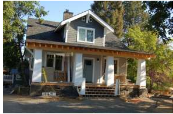
The Carl Brown House is undergoing rehabilitation to bring back its original character.

The commission has an opportunity to encourage a resurgence of authenticity. This could honor successful projects and encourage building owners to consult historic photographs and retain an architect in returning the character of a building to its original character. Potential strategies include a workshop to home owners and rehabilitation consultation sessions. A good example is the rehabilitation of the Carl Brown House, which is returning the exterior facade and porch to its original character.