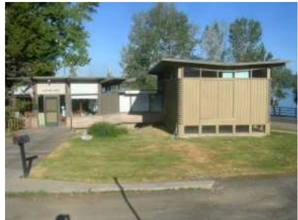
An example of mid-century architecture representing contemporary design.

The appreciation and awareness of mid-century modernist architecture and design in Idaho is growing through education and advocacy. McCall experienced a building boom during that period and has significant architectural gems, as well as living architects and designers who contributed to the landscape.