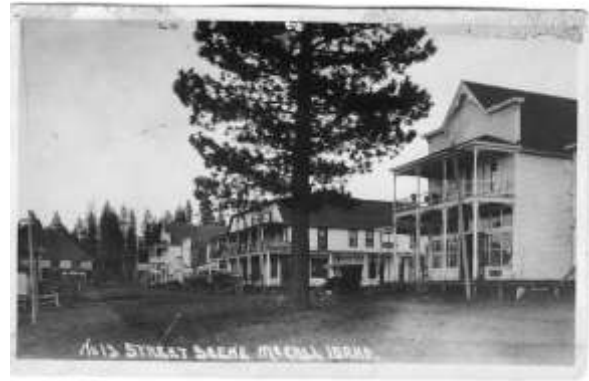
MLC1.011 Hotel Lakeview c 1920s postcard

This plan is intended to guide the commission and the city in protecting McCall’s historic and architectural character. The plan presents a vision and mission, a list and mapping of the city’s historic buildings, potential property nominations to the National Register of Historic Places, and preservation strategies and recommendations.