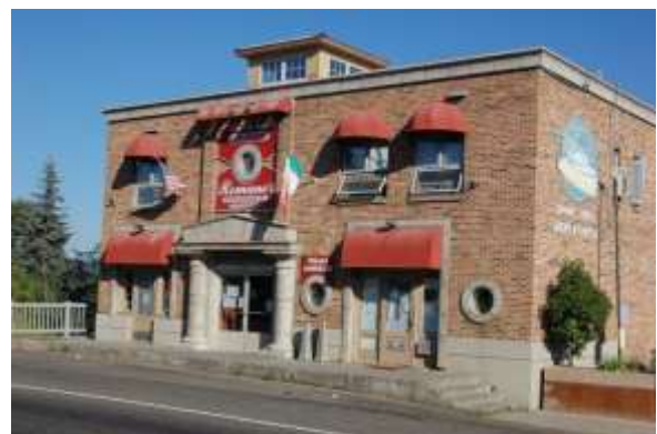
The Yacht Club is potentially eligible for listing on the National Register of Historic Places.

Located at 203 Lake Street, this 1946 brick building features nautical window openings shaped like life rings. The two-story plus basement building overlooking Payette Lake features a superb view and is significant for its contribution to the history of recreation on Payette Lake.