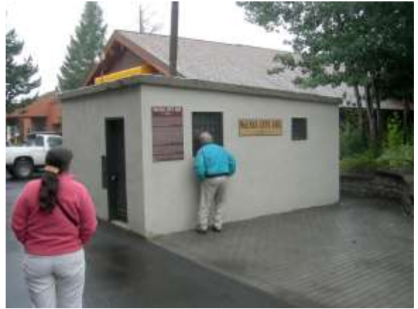
McCall City Jail.

Built in 1909, Lake Street Station was submitted in 1981 for listing on the National Register of Historic Places. The building was not accepted because it had been altered too significantly and did not retain enough of its historical integrity. However, the building is significant for its contribution to the history of McCall and the U.S Forest Service. A suggestion is to work with the property owner in gaining recognition for this early McCall building.