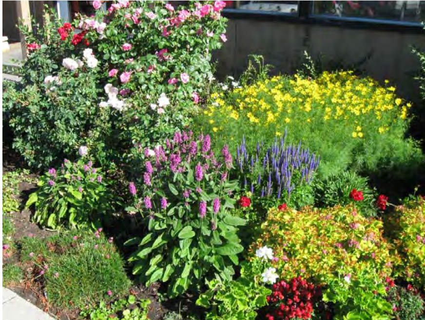
2012 Small Commercial Winner-Family Eye Center